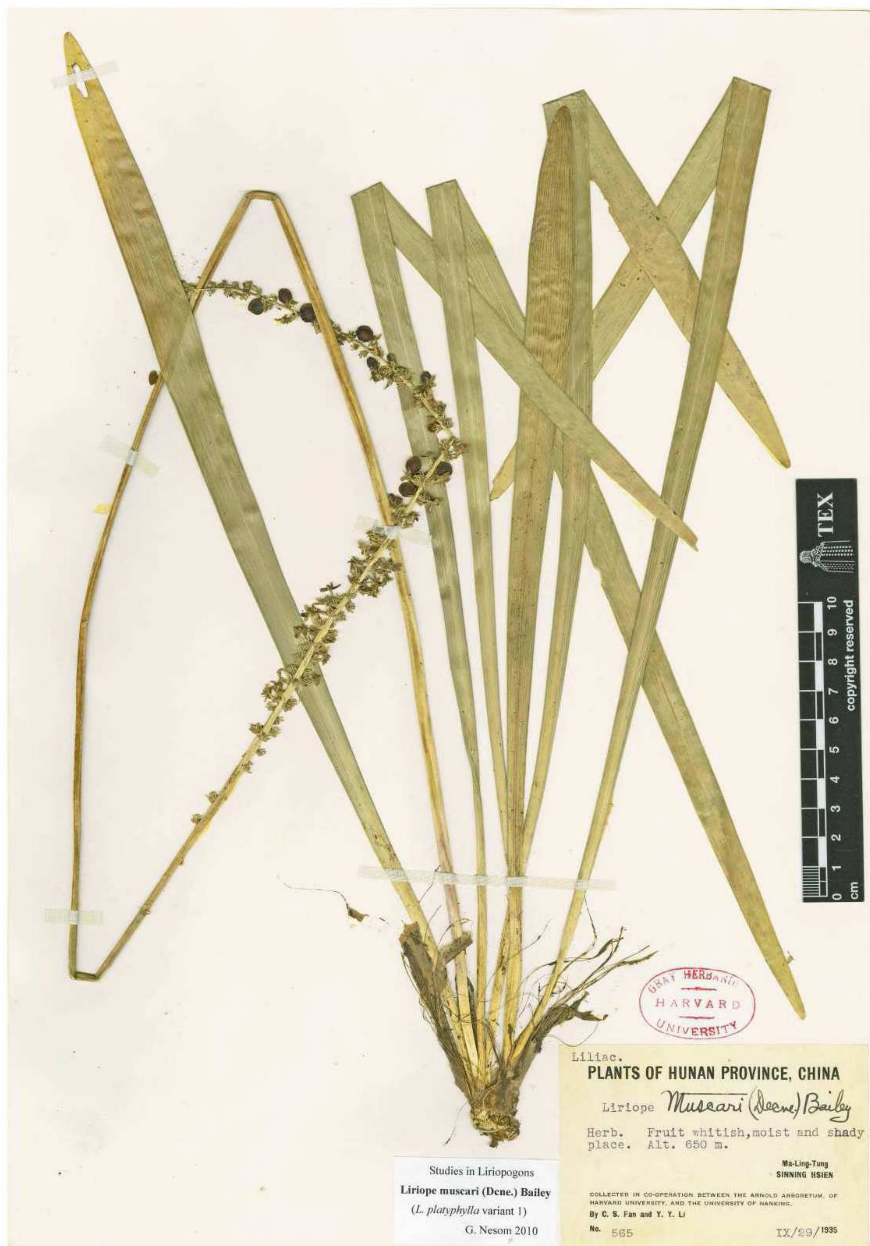
Figure 6. Liriope muscari sensu lato, “platyphylla” expression (see comments in text).